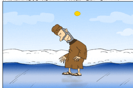
(See Matthew 14:24-33) 01-04-2008 PETER FINDS HIS FAITH TO BE MUCH STRONGER IN THE WINTER